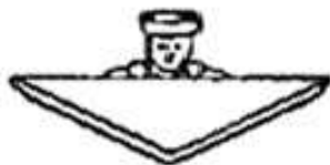
2. Fold Neckerchief diagonally to form triangle, seams inside