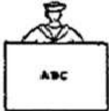
1. Correct Stencil