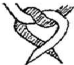
10. Cross long end over short