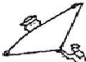
5. Repeat Step 3