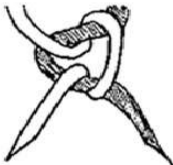
11. Bring long end back and thru the formed loop.