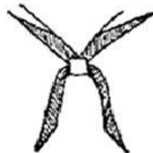
12. Shape knot as shown. Top of knot even with bottom of "V". Ends same length.